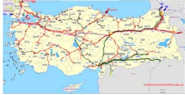
Fig. 7. Natural gas and petroleum pipelines in Turkey[20]

proposed coastal regions except the Dardanelles which is already a restricted zone due to maritime traffic.