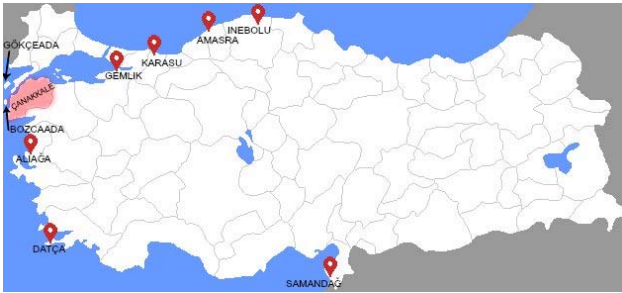
Fig. 2. Locations suitable for offshore wind power generation based on wind speeds.

These locations are also shown in Fig. 2.