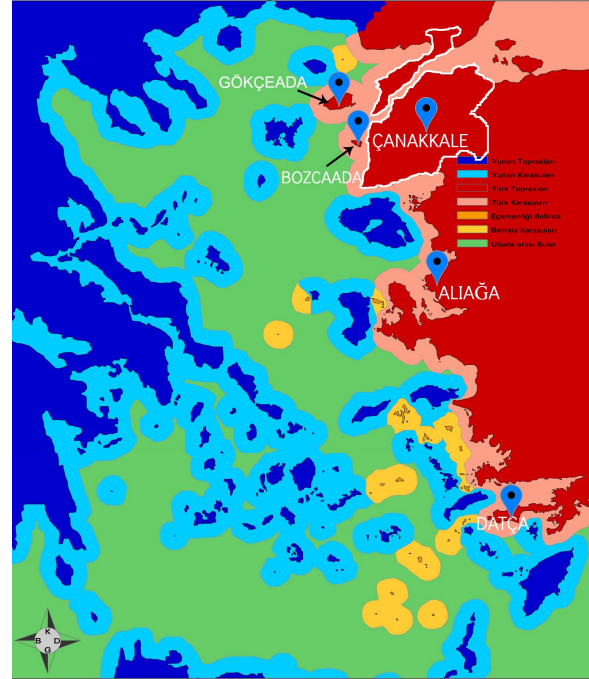
Fig. 3. Territorial waters between Greece and Turkey in the Aegean Sea [18]

The suitability of 10 regions for offshore wind power generation in terms of territorial waters is analyzed. Regions on the Black Sea and the Mediterranean Sea do not have territorial water problems thus Samandağ, Gemlik, Amasra, Karasu, and İnebolu can be considered for offshore wind power generation. Other regions are by the Aegean Sea thus suitability of shores for wind power generation should be checked in those territorial waters carefully. Fig. 3. shows the territorial waters between Greece and Turkey based on 6 nautical miles.