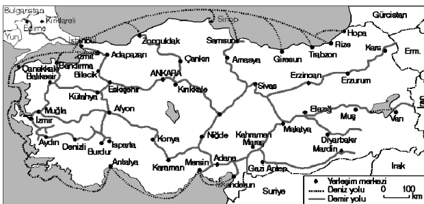
Fig. 5. Major maritime routes in Turkey

Major maritime routes in Turkey are shown in Fig. 5. The figure shows that maritime routes are not very close to proposed coastal regions therefore there isn't any problem for offshore wind power installation. İstanbul and Çanakkale dardanelles are only used for maritime traffic therefore they are not suitable for offshore wind power plant installation. When considering the location of the offshore wind power plant, local maritime traffic routes must be checked carefully for each of these regions for the suitability of the plant installation.