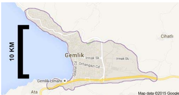
Fig. 6. Gemlik bay

Fig 6 shows Gemlik bay. Due to local maritime traffic because of a port at a very narrow bay in the region, Gemlik is not a suitable place for offshore wind power generation.