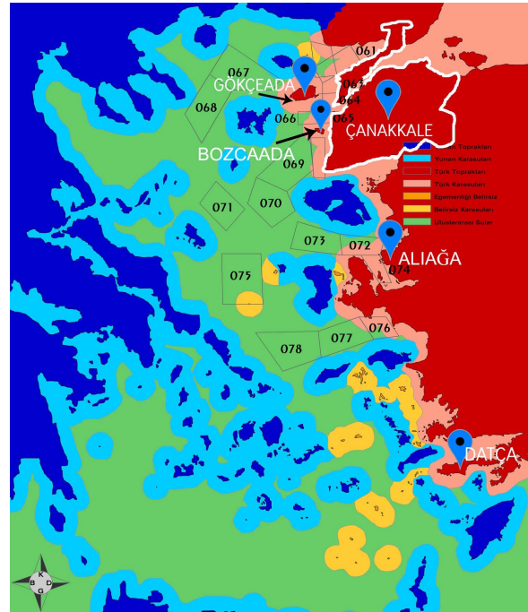
Fig. 4. Military Training Zones at Aegean Sea [18]

Based on the careful analysis of shores of Datça, Çanakkale, Aliğa, Gökçeada and Bozcaada in Fig. 3, it appears that offshore wind power installation only at Datça bay is relatively difficult due to close proximity between Datça lands and Greek islands.