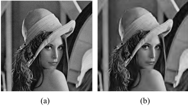
Fig. 4. (a) Compressed by DCT (b) Compressed by EZW

Results of the realized work are given in Table 1.