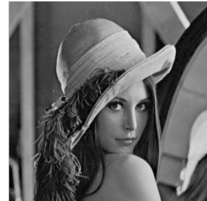
Fig. 3. Original image

We are comparing the images which are compressed by applying EZW and DCT using MATLAB.